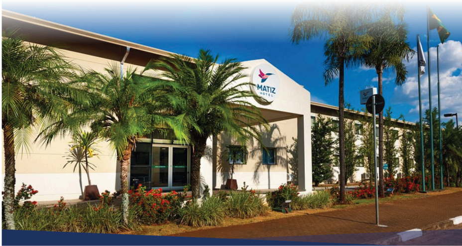
Hotel Matiz Barão Geraldo