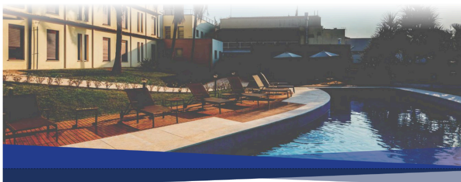
Casa do Professor Visitante