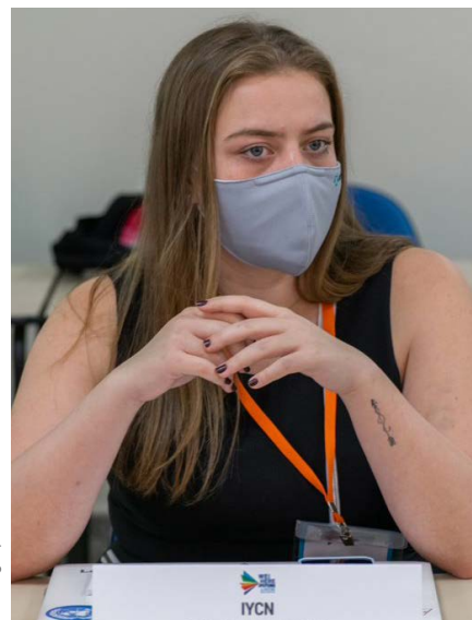
The delegate of IYCN at the University Youth Council