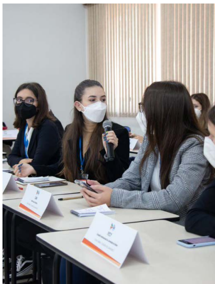
Delegates during the UNYC 2 debate on the amendments