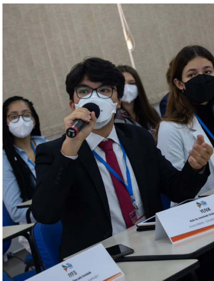
The delegate of YUVA during the UNYC 1 amendments negotiations